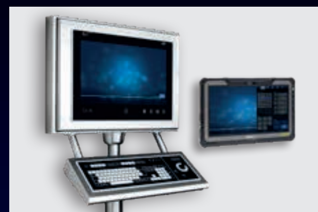
New, modular indoor operator stations ORCA and tablet PCs for mobile solutions

R. STAHL's Human-Machine Interfaces and HMI solutions are almost fully internationally certified for hazardous areas Zone 1, 2, 21, 22; and some also for Class I, Division 2 / Class II, Division 1, 2 / Class III. In addition to our HMIs, our portfolio also includes application-specific, mobile solutions such as tablets, smartphones and smartwatches.