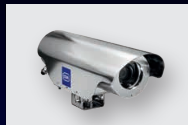
Full HD AFZ camera

YOUR ONE-STOP SUPPLIER FOR EX CCTV SYSTEMS An effective surveillance system needs more than just cameras. Only complete solutions which are perfectly matched to individual requirements can guarantee reliable surveillance and a maximum of security.